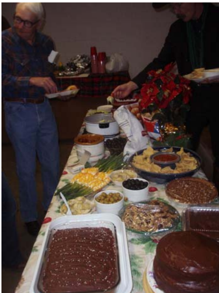
Above: Members and guests enjoy a festive meal. Left: "The Fixins!" Below: The stage decorations.