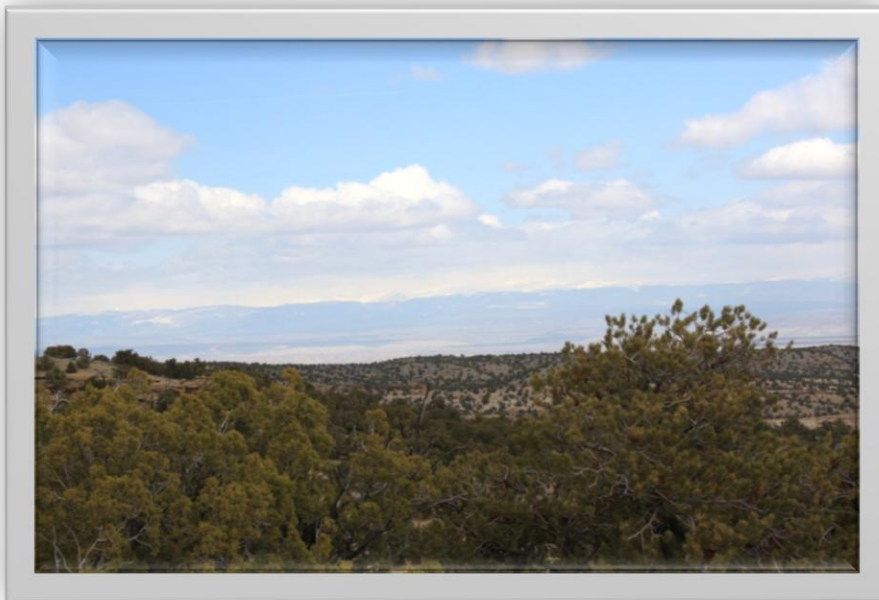
The snow-capped Uintah Mountains are seen in the background