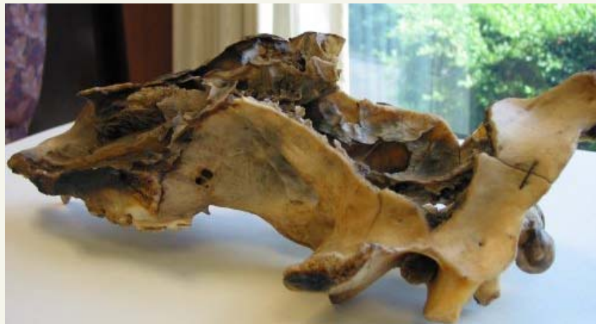
Old Ephriam's Skull

Day light at Last and Plenty mad So I went down there he was under some Willow in a deep Wash I couldn't see him very good so I got a Pole and tried to Poke him out He gave me the Slip and went down to camp and get in som short willows I got sight of a little Piece of Bear and Shot Into it And now Ephriam rose all in his greatness 9 ft. 11 inches with